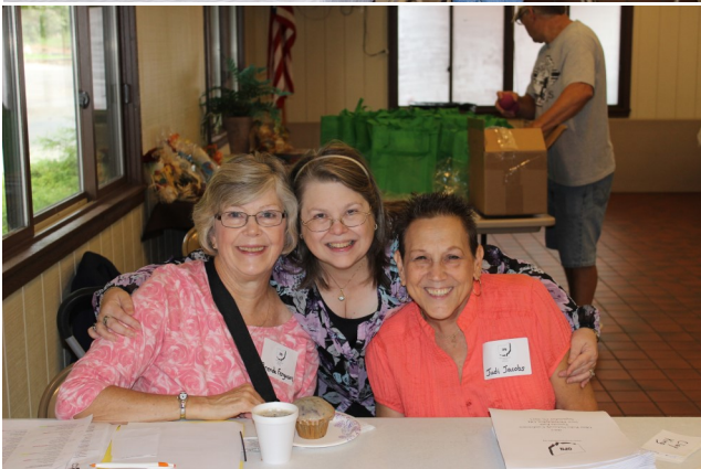
2015 Confer- ence Photos