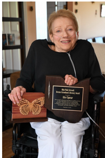
2018 Bernice Krumhansl Award