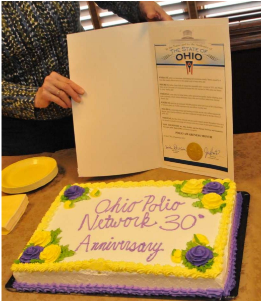
Ohio Polio Network 30th Anniversary Cake